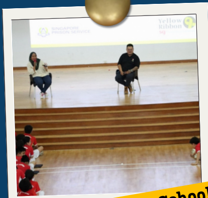
Fuhua Secondary School 15 Jan 2025