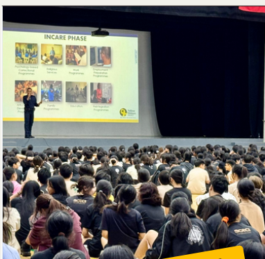
School of the Arts 4 Feb 2025