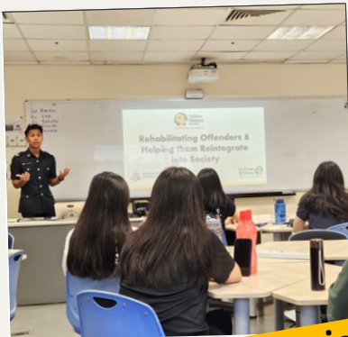
Ngee Ann Polytechnic 13 Mar 2025