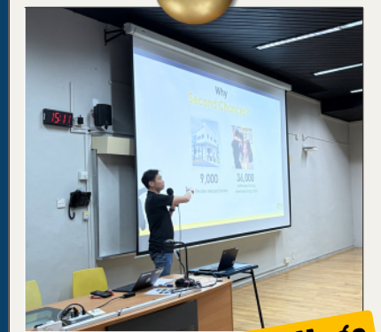
Victoria Junior College 2 Apr 2025