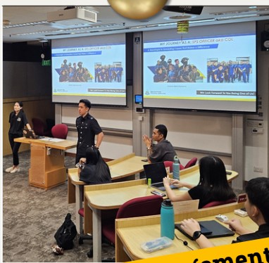
Singapore Management University 10 & 12 Mar 2025