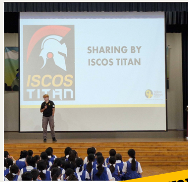
CHIJ St Theresa Convent 16 Jan 2025