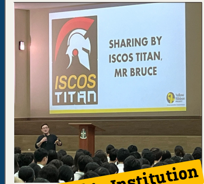
St Joseph's Institution (International) 22 Jan 2025