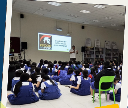
CHIJ Katong Convent 6 Mar 2025