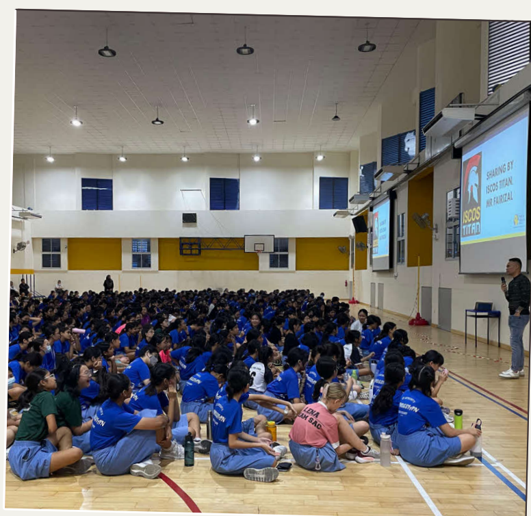
St Anthony's Canossian Secondary 14/08/2024