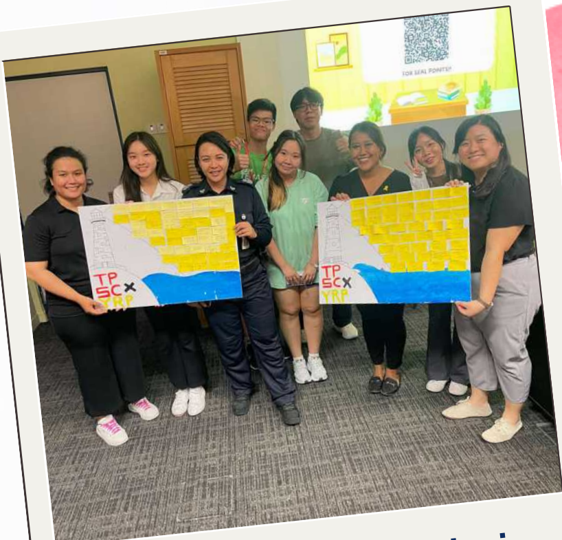
Temasek Polytechnic 07/08/2024