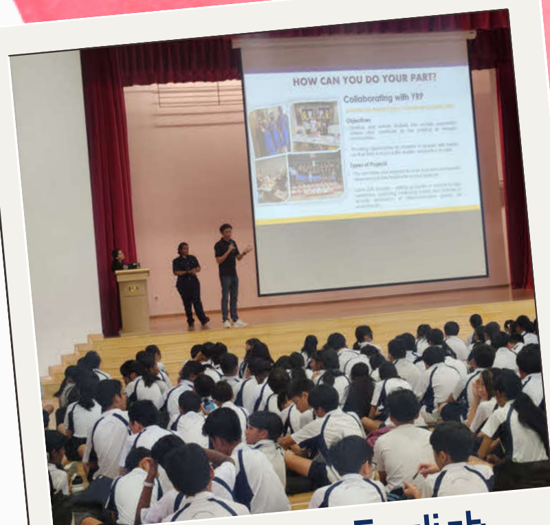
Assumption English School 22/08/2024