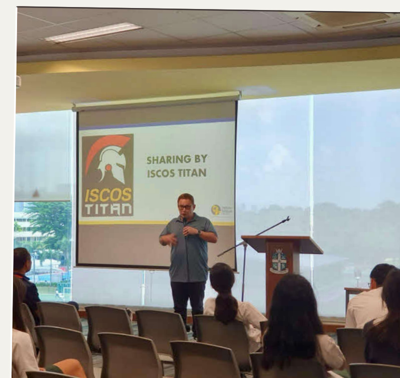
SJI International 20/08/2024