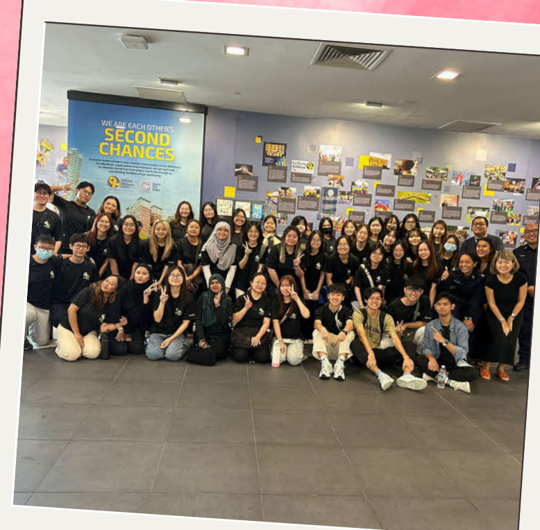
Ngee Ann Polytechnic 01/11/2024