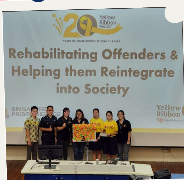
Anglo-Chinese Junior College 28/08/2024