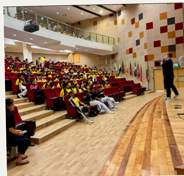
Victoria School 19/08/2024