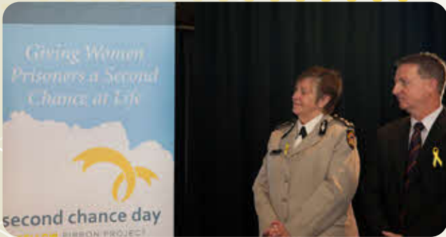
2011 Second Chance Day in Australia

The Second Chance Day in Perth, organized by Yellow Ribbon Project Australia, drew inspiration from similar initiatives in Singapore and Fiji. It created a greater understanding and empathy towards former female and youth prisoners, helping to break down the stigmas associated with incarceration. It also demonstrated how a supportive community can help former prisoners find new opportunities in the workplace, education, housing, and more. Personal stories of transformation and perseverance, fueled by a desire to give back, highlighted the importance of second chances and lived experiences.