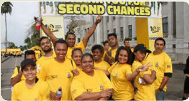
2008 Launch of Yellow Ribbon project in Fiji

Over the years, the Yellow Ribbon Project has not only garnered much support from many well-meaning individuals and corporate partners, but also gained traction beyond the shores of Singapore. It has gained international attention and been replicated in various forms across the globe. Singapore aspires and is committed to do more in creating a global Yellow Ribbon network.